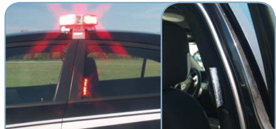
GHOST™ light permanent mounted in the interior side window to offer additional side visibility on a Dodge Charger.