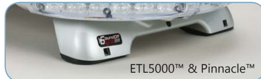
ETL5000™ & Pinnacle™