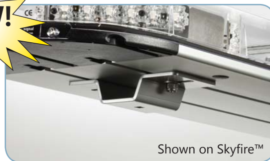
Shown on Skyfire™