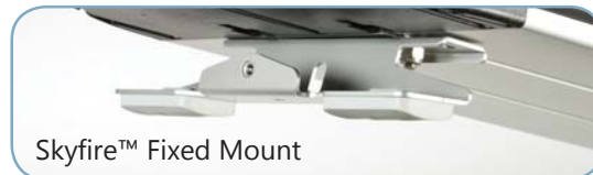
Skyfire™ Fixed Mount

• Easy to install Low Profile Fixed Mount Brackets mount the lightbar close to the roof line of the vehicle offering a stealthy, low profile appearance. Brackets are made from a durable stainless steel with non-slip rubber feet for extra grip. Clearance of just 3/4" on most vehicles.