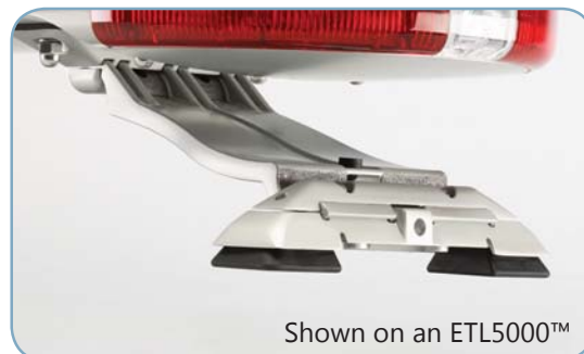
Shown on an ETL5000™

• Innovative Adjustable Height Mounting Bracket allow for custom height & tilt adjustments that allow for more flexibility than any other lightbar mounting system. Unique mounting feet allows for vertical height adjustment of 3 inches to provide low mounting height on Sedan applications and elevated mounting height for full size Van and SUV applications so a single bar has maximum visibility to traffic approaching from the front & the rear. Made with a durable & corrosive resistant stainless steel with large, rubber mounting pads for a cushioned, non-slip grip.